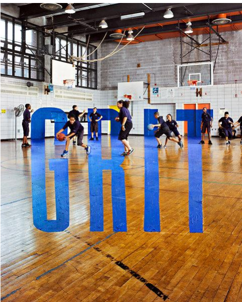
KIPP Infinity Middle School in Manhattan