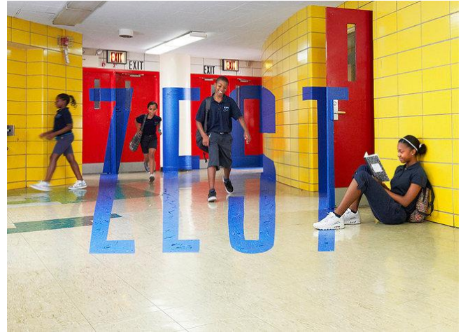
KIPP Infinity Middle School in Manhattan