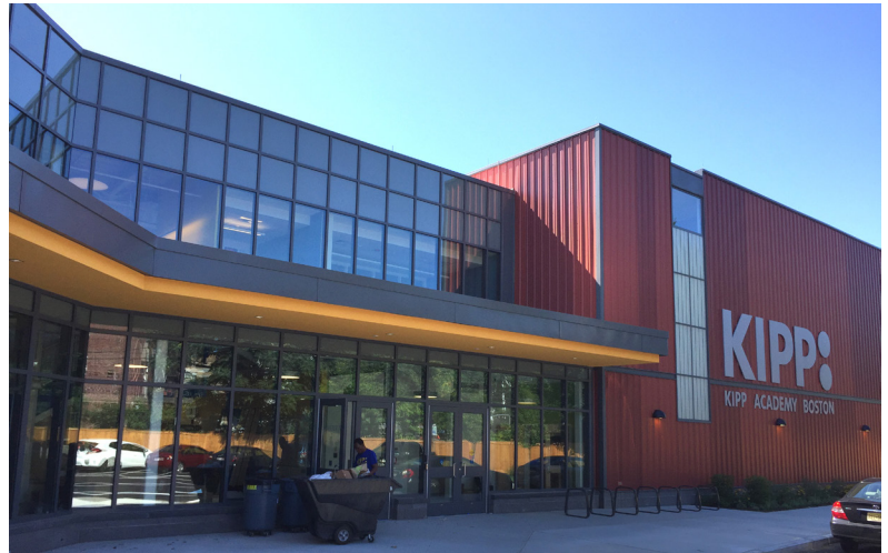
KIPP Academy building located at 37 Babson Street, Mattapan, MA 02126. Call 781-808-3901 to arrange a tour.