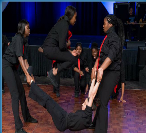
The KAL step team performs at the KIPP School Summit in Orlando, FL