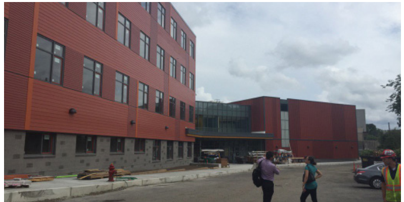
New building where classes will be taught with a Citizenship Class starting on August 17, 2016 at 37 Babson Street, Mattapan, MA 02126