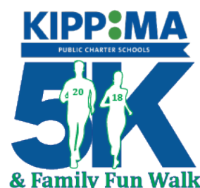
5K Run and Family Fun Walk

KIPP Massachusetts, @KIPPMASchools and Instagram at KIPPMMA Visit us @ www.kippma.org