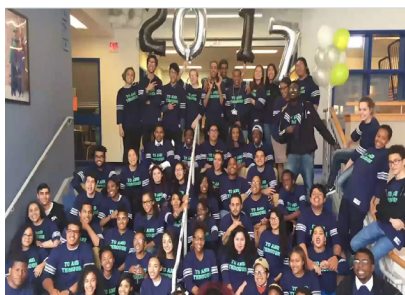
Student Commitment Ceremony May 25, 2018

On May 25th at 2 pm, the Class of 2018 will share their plans after graduation. Check out last year's video at www.kippma.org . This is KIPP MA's favorite day of the year and one that the entire high school attends. It is a joyful few hours filled with aspirations for each student's future and all are invited to join us!