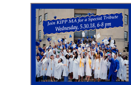
Special Tribute May 30th