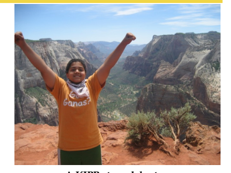
A KIPP-ster celebrates "making it to the top" in Utah

On June 19, KAL promoted its third alumni class on to high school in an inspiring ceremony for 71 graduating 8th graders. Members of the class of 2014 will be attending high schools such as: St. Mary's High School; The Pingree School,