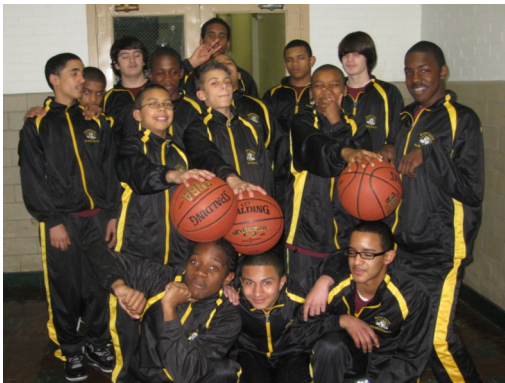
7th and 8th Grade Boys Team