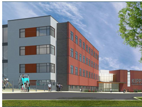
Rendering of new KIPP Academy Boston K-8 school in Mattapan